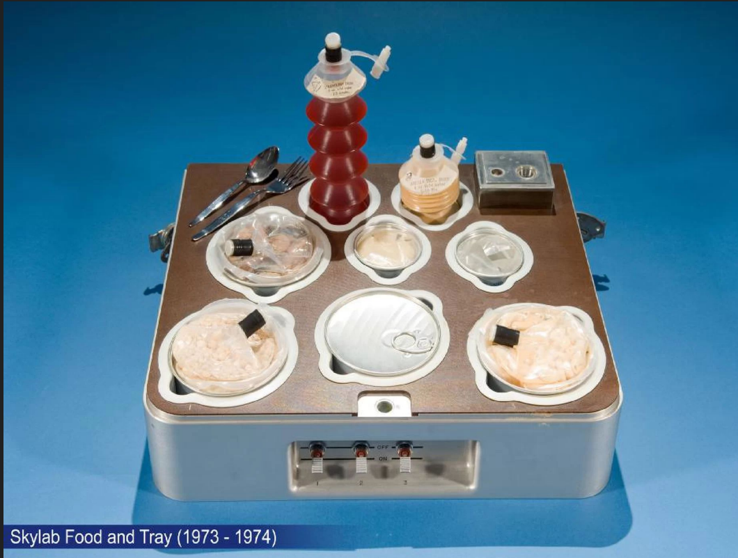
Skylab Food and Tray (1973 - 1974)