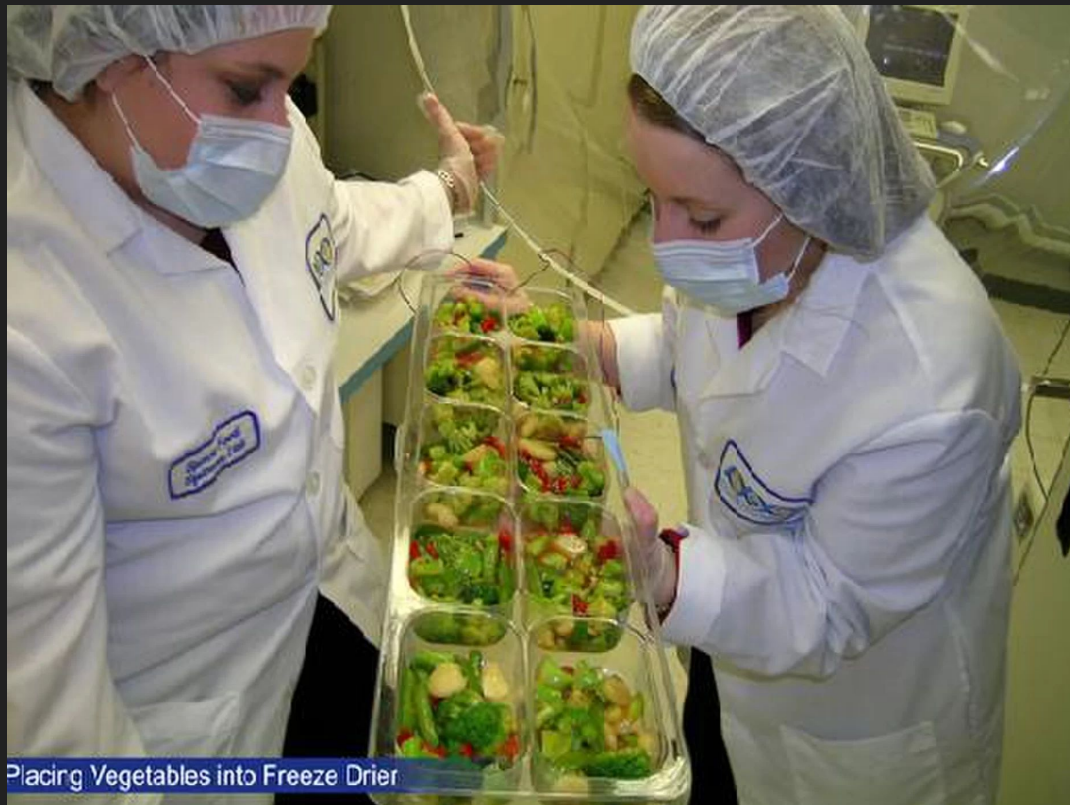
Placing Vegetables into Freeze Drier