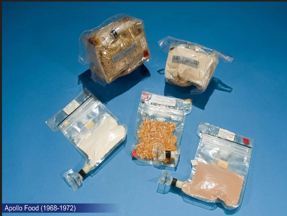
Apollo Food (1968-1972)