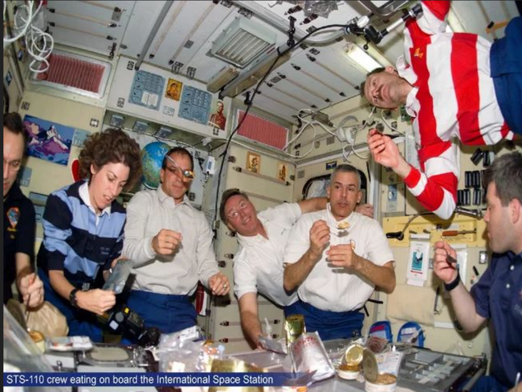
STS-110 crew eating on board the International Space Station