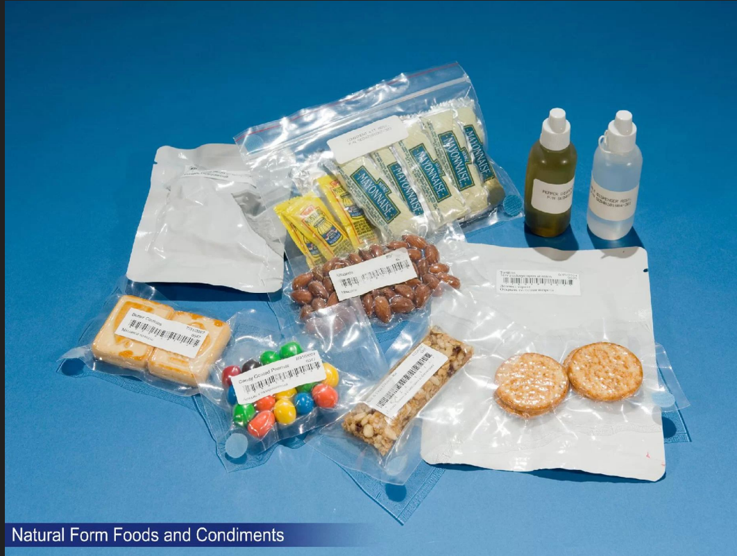
Natural Form Foods and Condiments