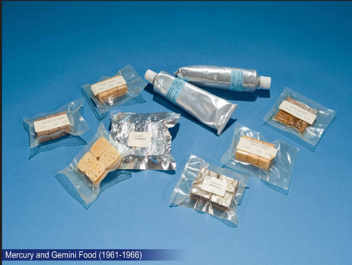
Mercury and Gemini Food (1961-1966)