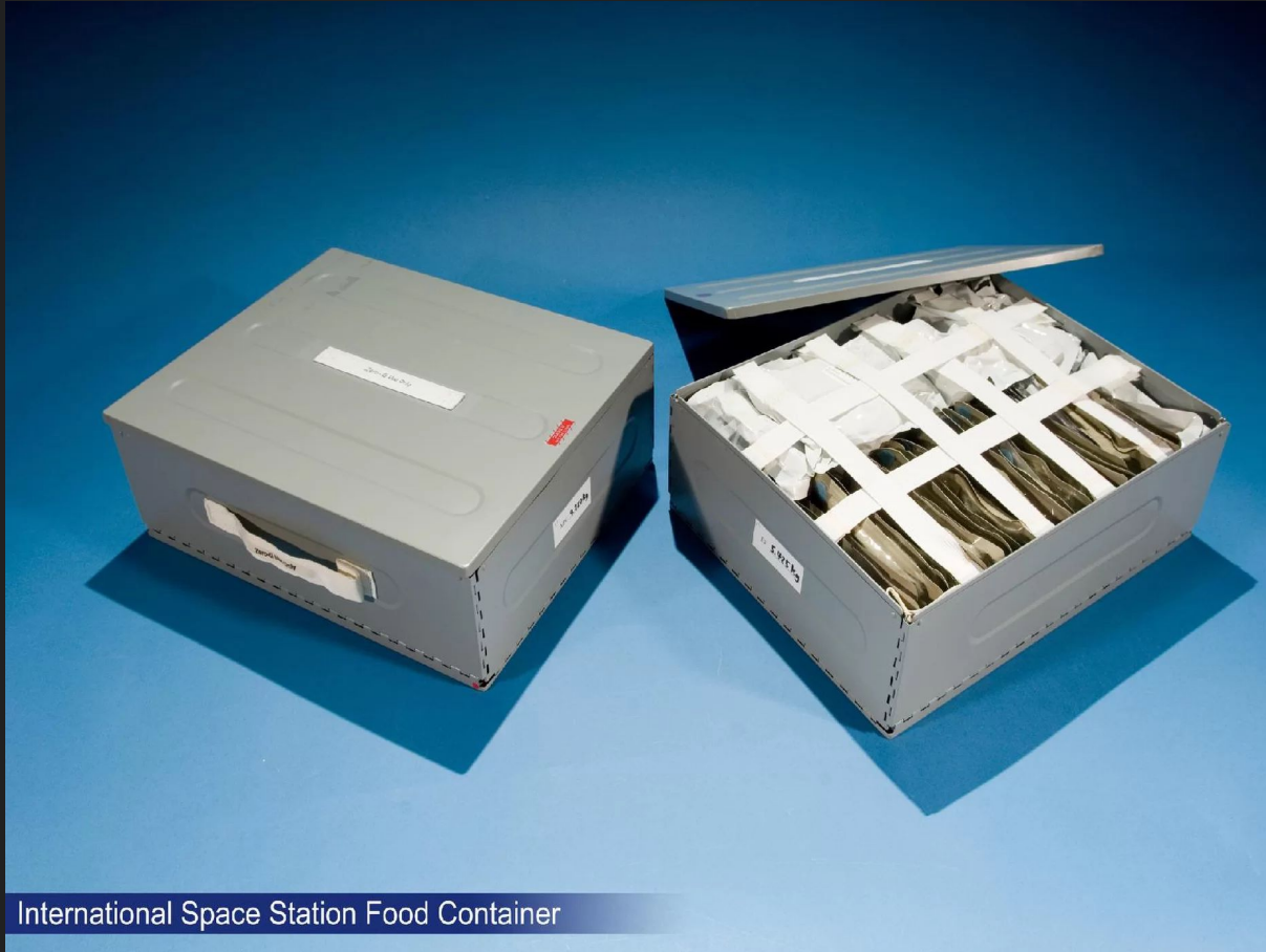
International Space Station Food Container