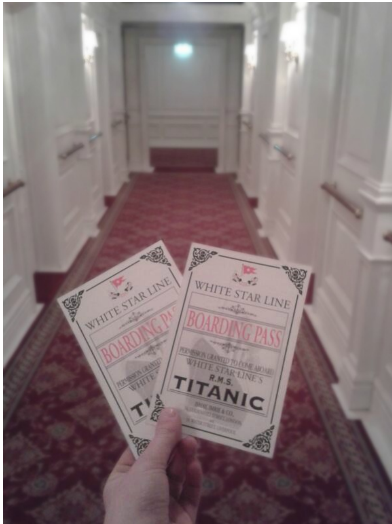
Image: a replica (copy) of the tickets you would need to board the Titanic. Passengers could buy either First Class, Second Class, or Third Class tickets.

Look at the back of this sheet for ticket prices and the number of tickets sold.