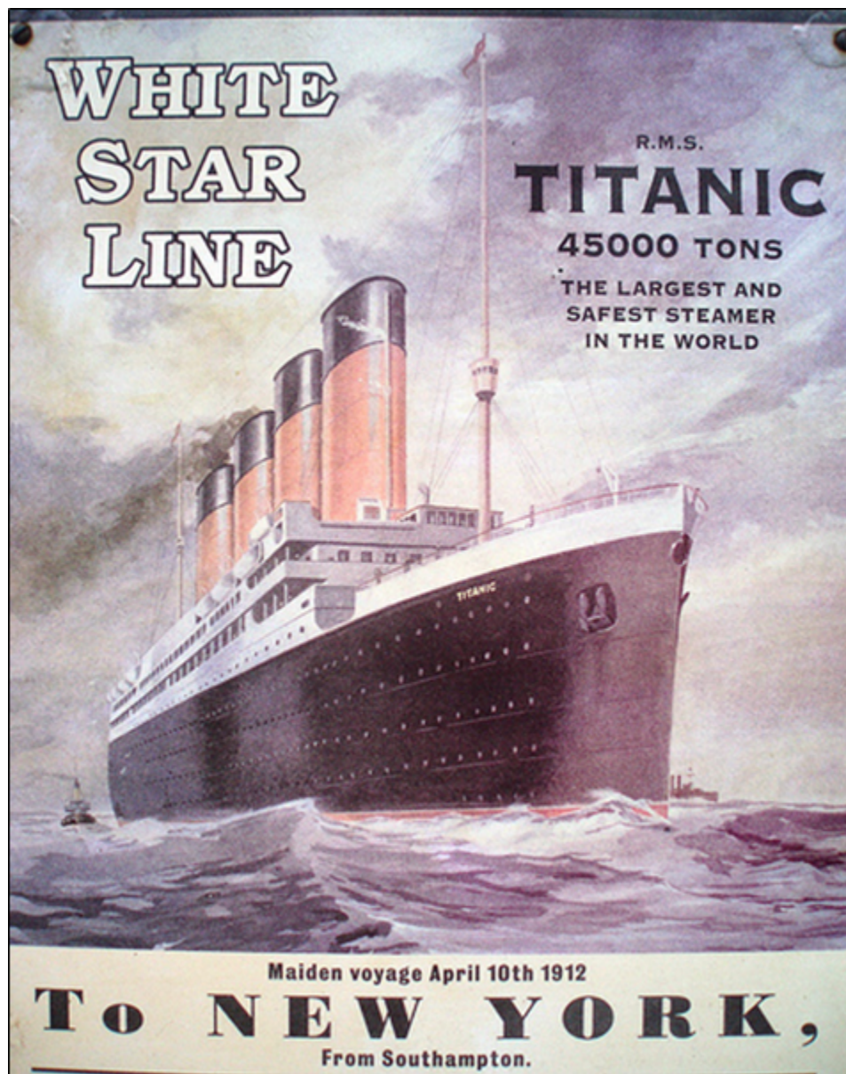
Image: an advertisement for the maiden (first) voyage of the Titanic.

Many people were so amazed by this ship that they rushed out to buy tickets, or saved up money to afford tickets on the "largest and safest" boat!