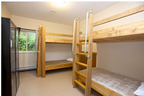
Student Cabins – Sleeping Quarters