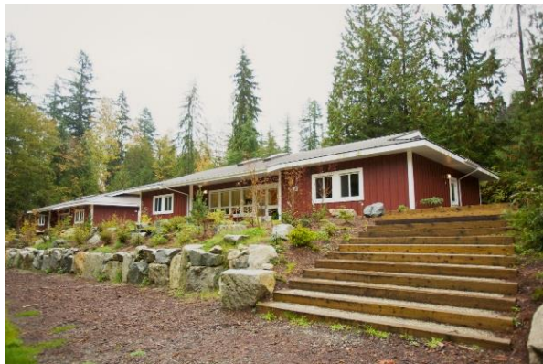
Student Cabins – Exterior