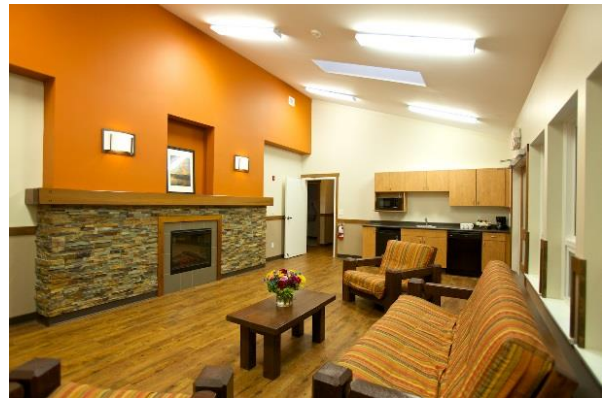
Student Cabins – Interior 1