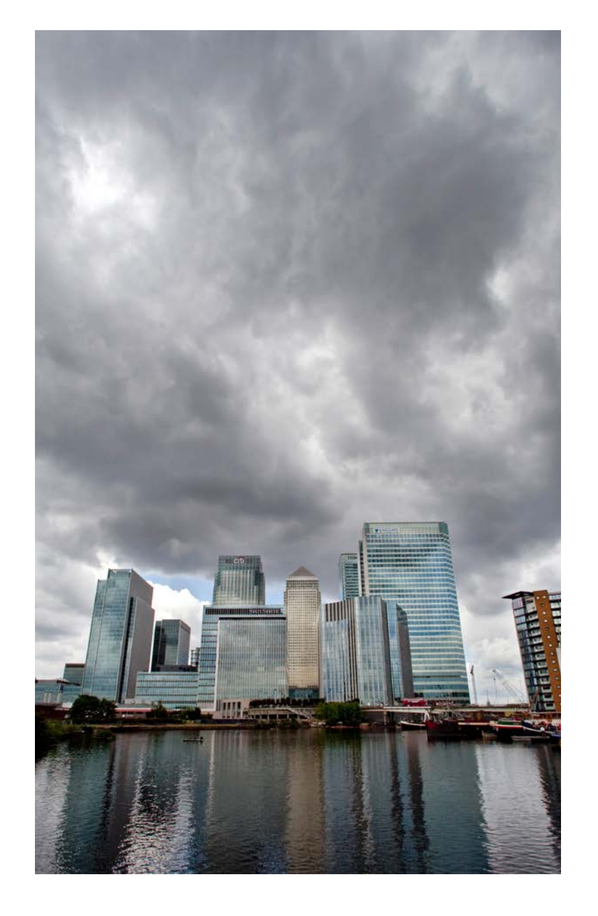
I see the clouds.