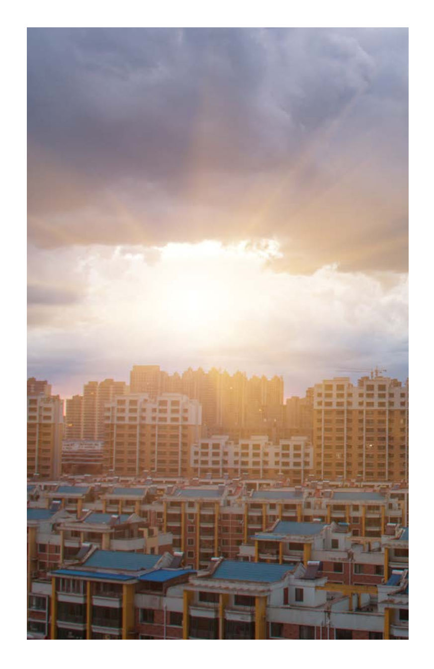
I see the sun.