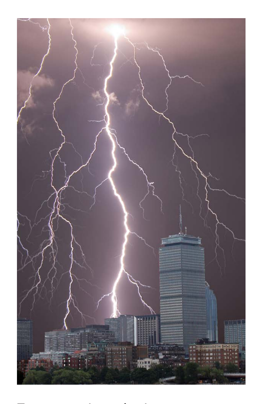
I see the lightning.