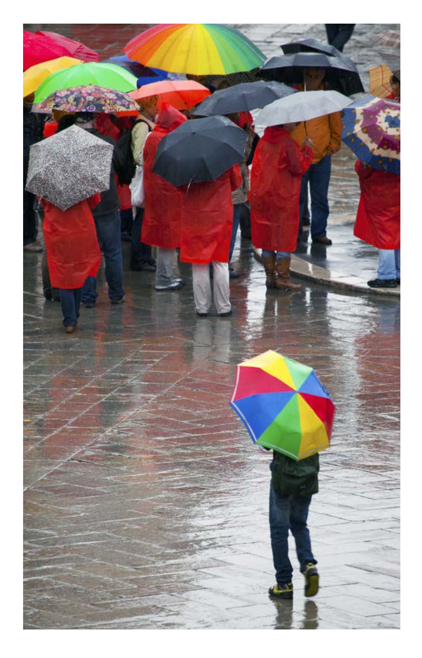
I see the umbrellas.