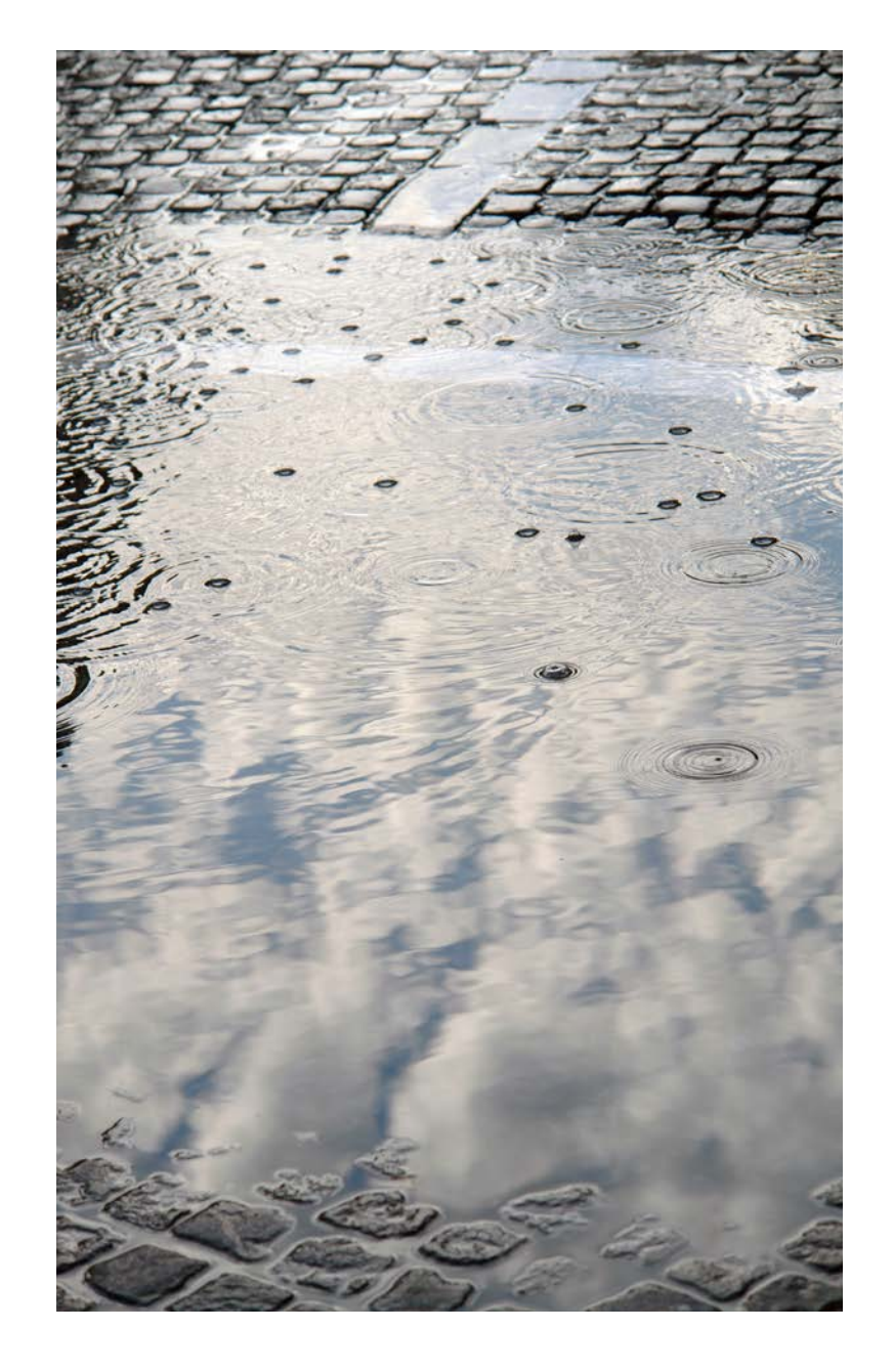
I see the puddle.