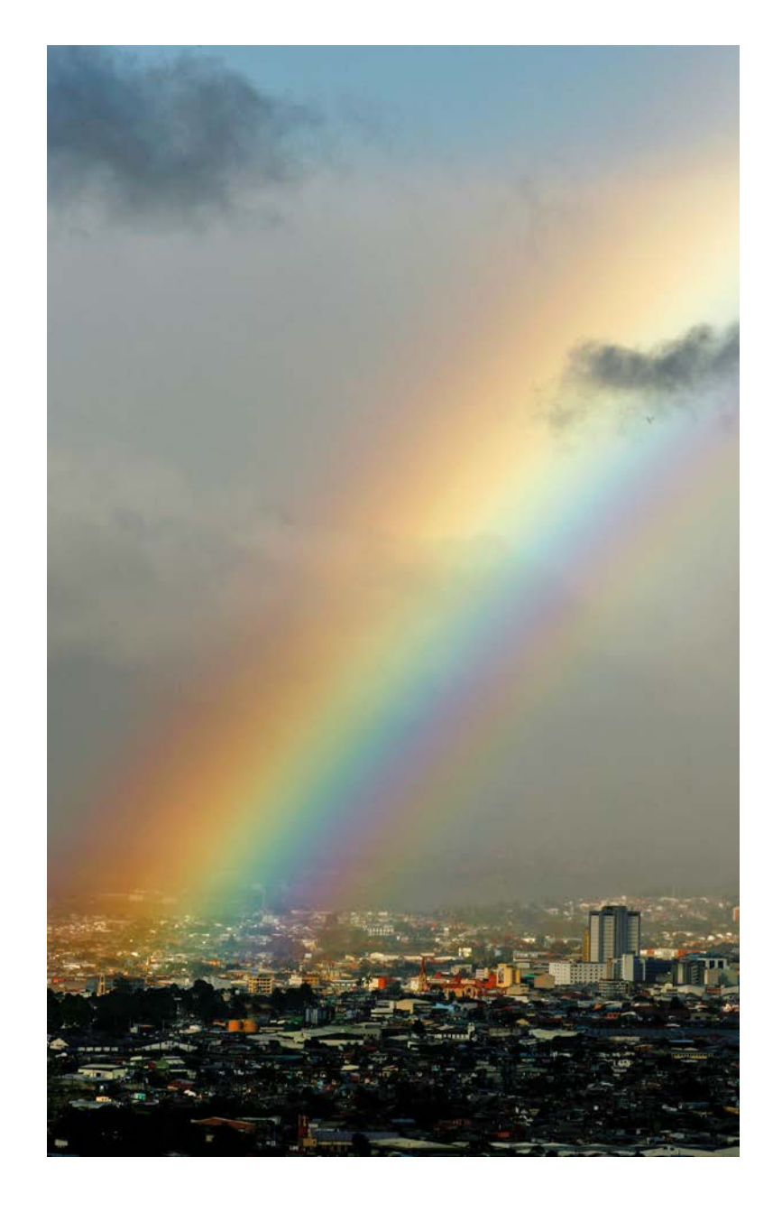
I see the rainbow.