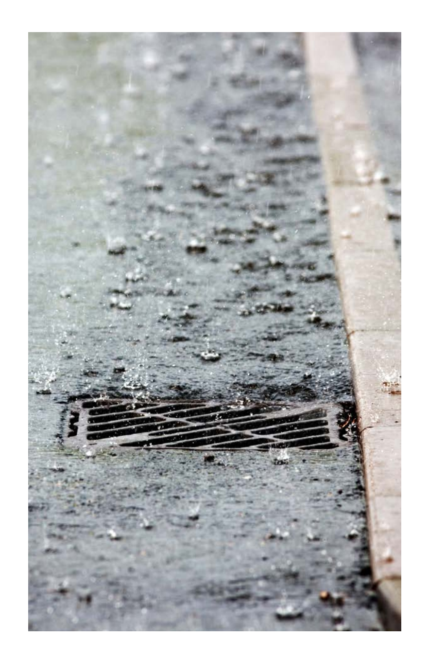
I see the drain.